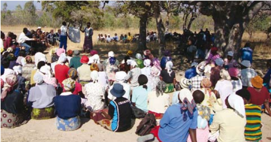
Visioning with the Nyahava community to revitalise Zunde raMambo (F. Mtambanengwe)

resources no longer enable them to develop appropriate response mechanisms. These experiences point to the urgent need to revitalize local safety nets.