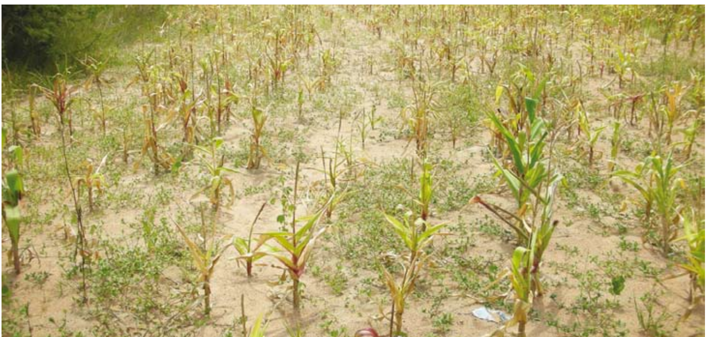
Zunde raMambo has often failed to attract community participation due to low productivity (P. Mapfumo)

government has over time effectively eroded the Zunde raMambo, and weakened social cohesion for collectively addressing local problems. The weakening of national social security schemes due to resource limitations, erratic food relief supply chains and politicization of food aid, against a backdrop of declining per capita food production, has rendered local communities even more vulnerable than before. Government agencies and local authorities have tried to revive Zunde raMambo, but lack of community cohesion and poor productivity have continued to pose major challenges. Climate change and variability has begun to widen the scope of vulnerable households, to include those whose