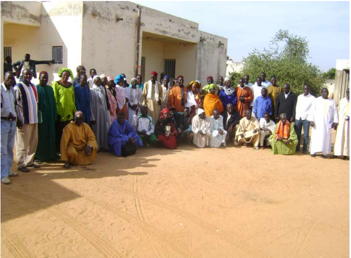
Producers' Forum held in the Notto Diobass community house in preparation for the 2008 crop year