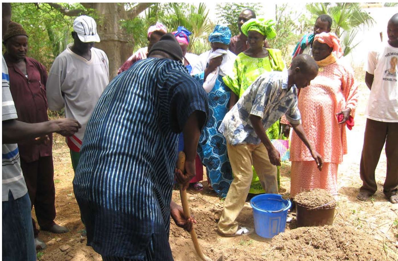
A demonstration session on mango planting techniques during a 2009 forum

These changes exacerbate the vulnerability of rural populations in the region of Thies. The knowledge and practices acquired by farmers through a trans-generational accumulation of observations, innovations and forms of adaptation that guided their technological and economic choices, are now in most cases obsolete. The sowing, cultivation techniques and tillage dates used today seem inappropriate to new climate conditions.