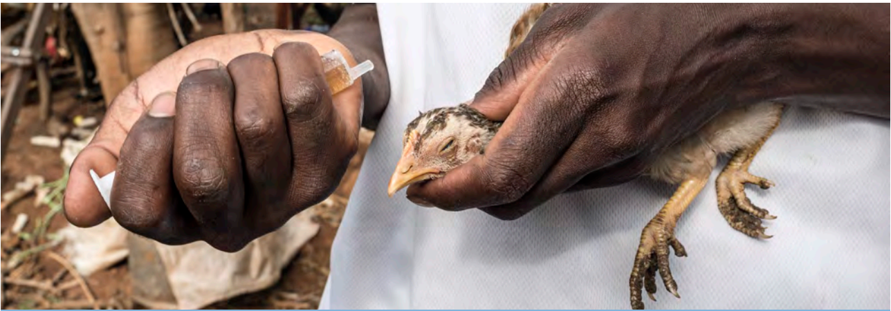
Vaccinating indigenous chickens against Newcastle disease

the research to address. Women, in particular, selected improvement of poultry management as a priority means of strengthening livelihoods in the face of climate change. Farmers (37 women, 24 men) were then trained to serve their communities as providers of poultry-related information and services, including vaccination. The training aimed to build networks of trainees to support the implementation of husbandry and group marketing practices on a larger scale.