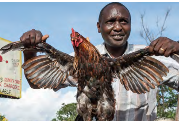
An indigenous chicken market

Up to 98% of families in rural Kenya keep small flocks of chickens, mainly local or ‘indigenous’ types. Chicken-rearing is traditionally considered a women’s activity, but provides assets which benefit the whole household. Indigenous