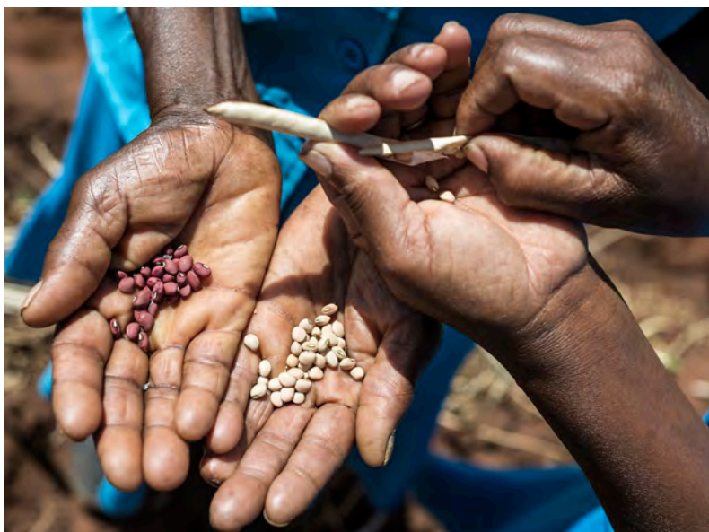
Women with two cowpea varieties

group marketing of green grams and cowpeas.