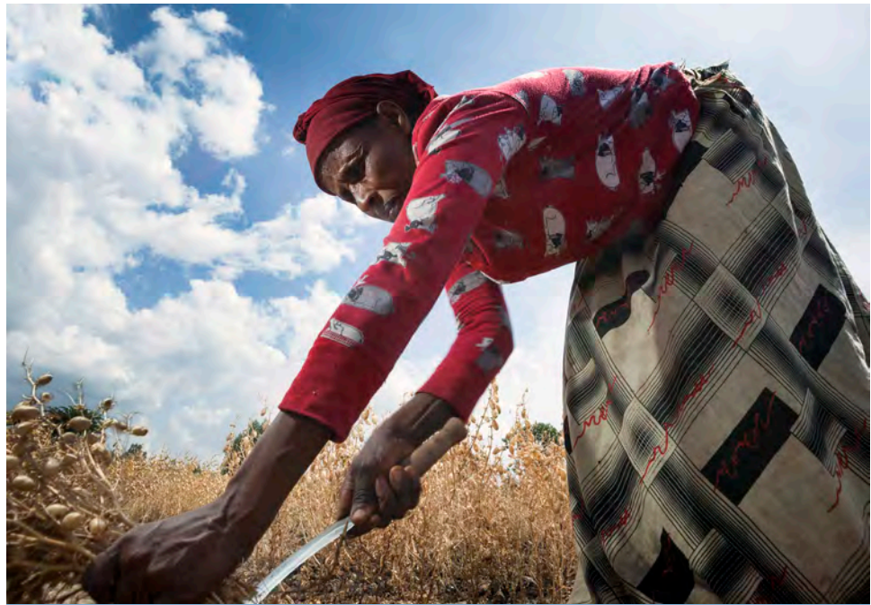
A farmer harvesting chickpea in Halaba

A balanced mix of theoretical and practical sessions during the extension training has enabled 158 female and 636 male farmers to acquire knowledge and skills on seed production and better management practices, including row planting, spacing, fertilizer application and pest and disease identification and control. Training sessions, followed by house and farm visits by local development agents, have helped women farmers in particular to develop networks for sharing information. These have provided a good opportunity for women to share their experience and enhance their field management. As a result, women outside the project are also keen to join the networks.