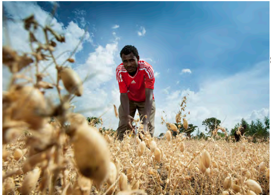
A development agent analysing the performance of an improved chickpea variety in Halaba

system, research, seed supply and farmers' organizations is also vital. Bodies such as the Southern Regional Bureau of Agriculture, the South Agricultural Research Institute, the South Seed Enterprise, the Farmers' Cooperative Federation and the zonal and district agricultural offices have all provided essential support since the initiation of the project, and helped to remove long-standing bottlenecks.